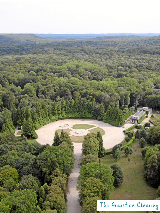
The Armistice Clearing

On the afternoon of 10 th November 2018, the President of the French Republic, accompanied by the German Chancellor, will preside over a ceremony at the Armistice Clearing in the commune of Compiègne. This ceremony will be defined by the simplicity of a moment of silent reflection and of tribute.